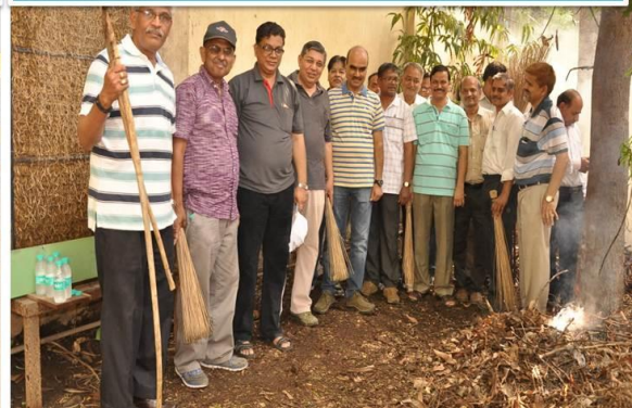
MECL employees participating in the Cleaning Drive