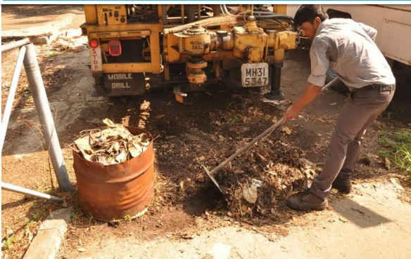
Picking up the garbage