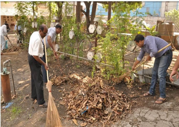
Cleaning the garden area