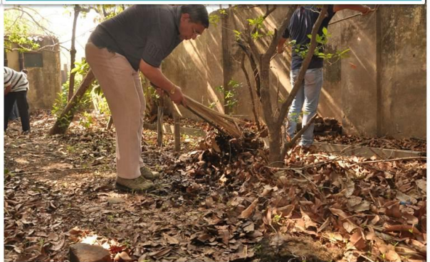
Cleaning the backyard